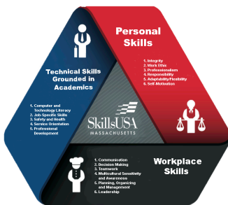
The SkillsUSA Framework