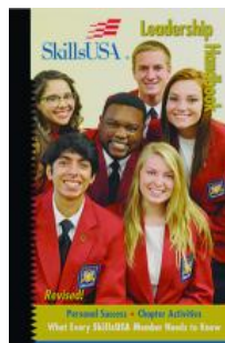
SkillsUSA Leadership Handbook