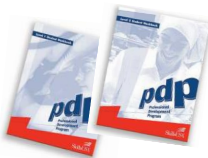
The Professional Development Program Levels 1&2 (print or on-line versions)

Available: February 1, 2017 SkillsUSA Massachusetts Official Employability/Safety Quizlet: URL: http://bit.ly/madistrictemp